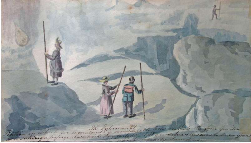
Fig 5 'The Experiment. Position in which we remained a considerable time while the four Guides were seeking a passage in which they failed – but ourselves discovered an issue [?] which finally saved us', 22.5cm x 13cm, 1822. Double-sided backed with Fig 9 'Arrival at Night'.