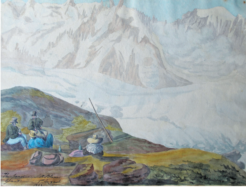
Fig 2 'Le Jardin, Mont Blanc, Geant', watercolour and ink inscribed with title and date, 21.6cm x 28.5 cm, 1 August 1822.

intensive and courageous excursions among the Alps, 1 left their footprints in history when they became the first women to cross the Col du Géant, from 'Chamouni' to Courmayeur. Although offering the shortest passage from one valley to the other and therefore avoiding the 'tedious' alternatives, the rigours of the Glacier du Tacul had long deemed the route to the col 'impracticable', and even as 'despairing' by Bourrit. 2 Yet by 1788 de Saussure had made the spot memorable by his extraordinary 16-day residence there. Nevertheless, in 1822 it remained a hard and unfrequented passage rising to over 11,000ft at its crest. Even by 1843 Forbes still determined 'notwithstanding its immense height it would be frequented but for the dangers of the glacier on its northern side.' 3