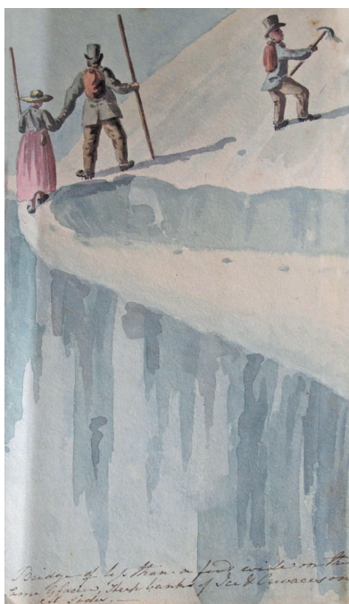
Fig 4 'Bridge of less than a foot wide on the same [Tacul] Glacier. Steep banks of Ice & Crevaces on all sides', 22.5cm x 12cm, 1822. Double-sided backed with Fig 6 'The Cachat Impossible'.

the Col du Géant two or three hours before we reached the Petit Mulet, and that while we were near that rock they were descending at Courmayeur. 5