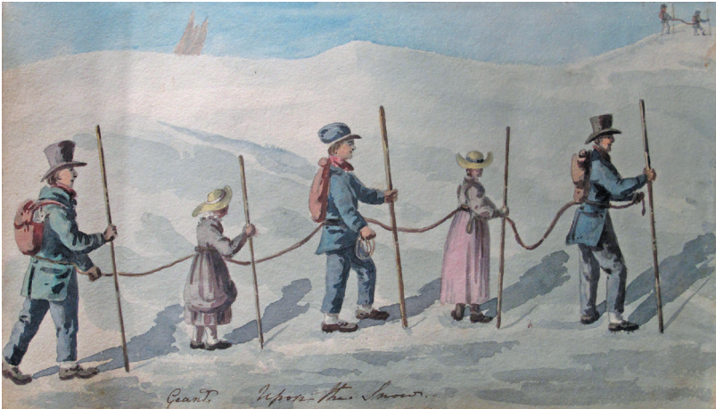
Fig 1 'Geant. Upon the Snows', watercolour inscribed with ink, 22.6cm x 12.8cm, 1822. All illustrations by Elizabeth Campbell. Double-sided and backed with Fig 8 'Summit of the Col du Géant'. (All illustrations courtesy of Tony Astill.)

Images from the First Female Crossing of the Col du Géant