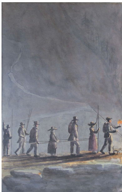
Fig 9 'Arrival at Night 19th August 1822', 22.5cm x 13cms, 1822. Note the addition of a small dog to the party on the descent to Entrèves. Double-sided backed with Fig 5 'The Experiment'.

to Coligny, 1818', 18 to outline crisply the topography of a landscape that was yet to be explored. In contrast her sketchy 'L'Aiguille de Dru & end of the Mer de Glace 1818', cleverly stresses her diminutive viewpoint from very close to the glacier wall; Elizabeth allows the moraine, meltwater and seracs to entirely dominate the picture plane. In 1819 the view of the picturesque 'Bridge at St Martin over the Arve' was captured from the roadside. And in 1820 several views of the village of Chamonix were taken with the Arve and the Priory as her focus, with just a few foreground figures to aid perspective. Similarly on 4 August 1822, the year of their crossing, Elizabeth also painted the village from the chapel close by. Views of 'Montanvert', the 'Mer de Glace', and the 'Glacier des Bois' dated 1827 are Elizabeth's latest known drawings of the Chamonix valley which had clearly captivated her. Regrettably there is no known written account of these years of travel although Elizabeth did keep a journal to accompany her watercolours for her 1825 excursion to Sicily. 19