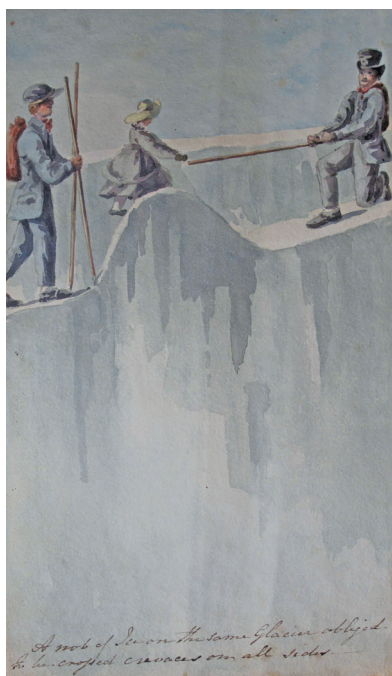
Fig 3 'A nob of Ice on the same (Tacul) Glacier obliged to be crossed crevaces [sic] on all sides', 22.6cm x 12.8cm 1822. Double-sided backed with 'A passage on the glacier'.