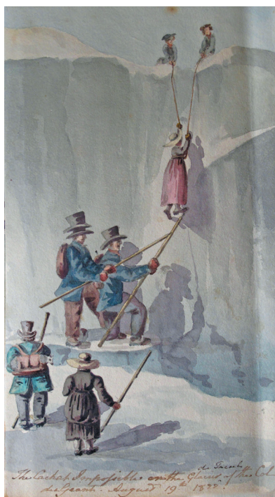
Fig 6 'The Cachat Impossible, on the Glacier du Tacul of the Col du Geant, August 19th 1822', 22.5cm x 12cm, 1822. Note the guide wearing two hats. Double-sided backed with Fig 4 'Bridge of less than a foot wide'.