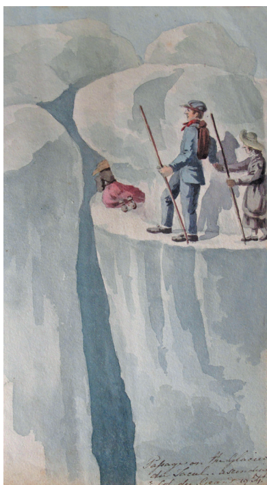
Fig 7 'Passage on the Glacier du Tacul, ascending Col du Geant 19th Aug. 1822, 22.6 x 12.8 cms. Double sided backed with A nob of ice.

the whole length of the Mer de Glace to visit the Jardin, a rock covered with vegetation and flowers, which forms an oasis in the middle of these icy solitudes, they climbed to the top of Buet, the most difficult point to reach in this whole chain. These different routes last ten or twelve hours, and a great part of the way is silent in snow and ice, across crevices and along precipices. 11